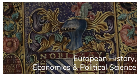
European History, Economics & Political Science