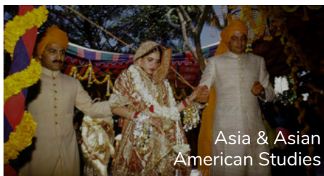
Asia & Asian American Studies