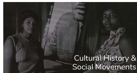
Cultural History & Social Movements