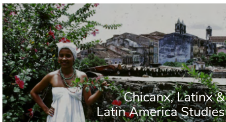
Chicanx, Latinx & Latin America Studies

The following is a sampling of the subject areas that can be found within our Special Collections & Archives.