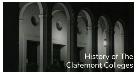
History of The Claremont Colleges

Explore more topics by visiting 7clib.cc/SCAsubjects .